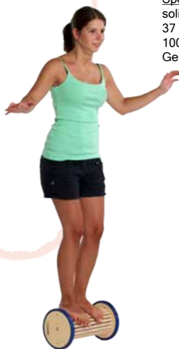
Item no. 143 004

Specification: Multiplex birch wood and solid beech, tyres blue, Ø 22 cm, width 37 cm, maximum weight capacity approx. 100 kg, weight 2.4 kg, exercise book in German language included.