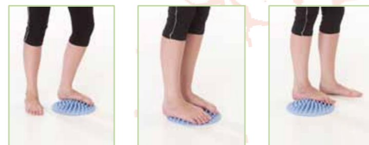
Item no. 143 028