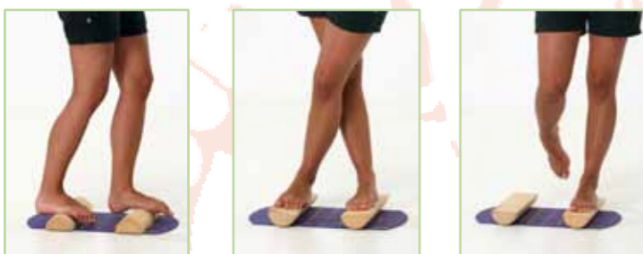
Item no. 653 098