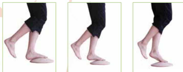
Item no. 143 160